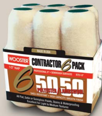
R751 50/50 6-Pack Great Contractor Value