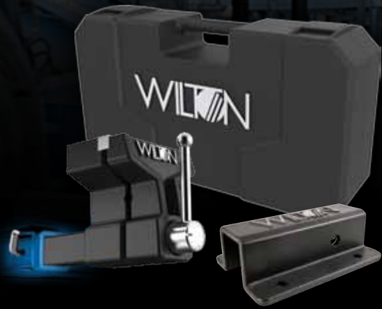
ATV WITH MOUNTING BRACKET AND CARRYING CASE