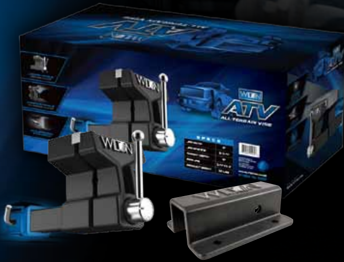
ATV WITH MOUNTING BRACKET