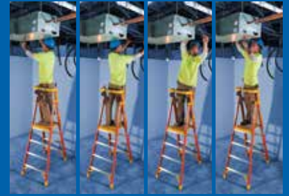
Work Facing Any Direction