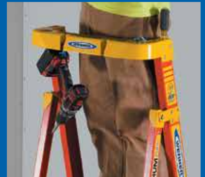
Extended Guard Rail