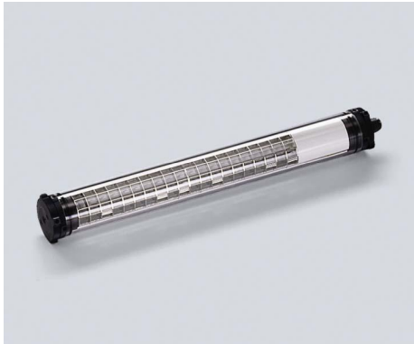
RL70CE - 136 H