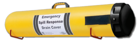
Optional Ultra-Drain Seal Wall Mount Units allow quick response to any spill — just “grab and go”!