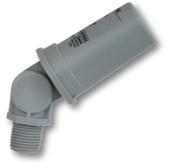
EPC2 EPC-A EPC-LC