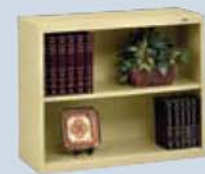
2-opening 28" HIGH