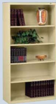
5-opening 66" HIGH