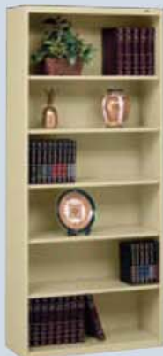
6-opening 78" HIGH