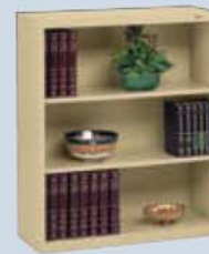
3-opening 40" HIGH