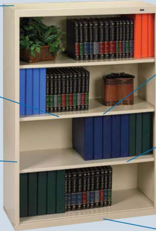
Above unit is shown in our Champagne Putty finish.

Provides extra strength and allows for easy retrieval of materials.