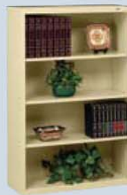
4-opening 52" HIGH