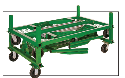
Pipe Mac stacks with other Pipe Macs or with Mac Racks.