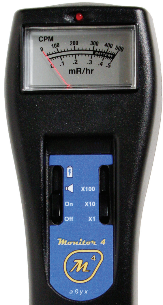
M4 with CPM & mR/hr meter scale

Analog Meter holds full scale in fields as high as 100X maximum reading. CPM & mR/hr scale. Optional SI Scale Meter Available