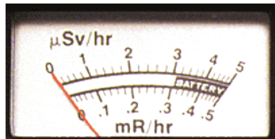
Optional SI Meter Scale: 0-500 µSv/hr & 0-50 mR/hr