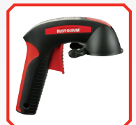
Comfort Grip #241526 Ergonomic design provides maximum comfort