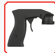
Spray Grip #243546 Turns any spray can into a spray gun