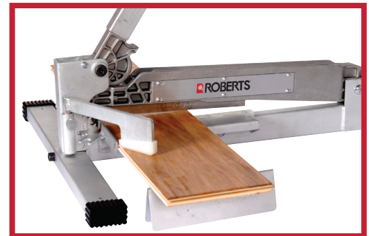
Positionable support arm and "V" support hold planks in place for accurate clean cuts.