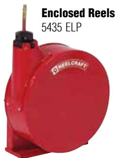
Enclosed Reels 5435 ELP