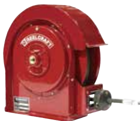
Air Vend Reels AV4425 OLPBWR