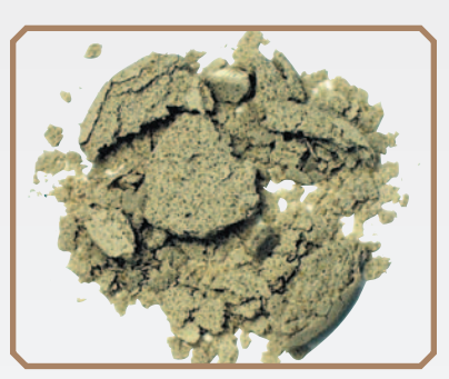
Brand D: Immersion in Methylene Chloride for 4 hours