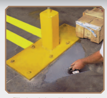
Fills deep holes without cracking

Other Rust-Oleum topcoats also available.