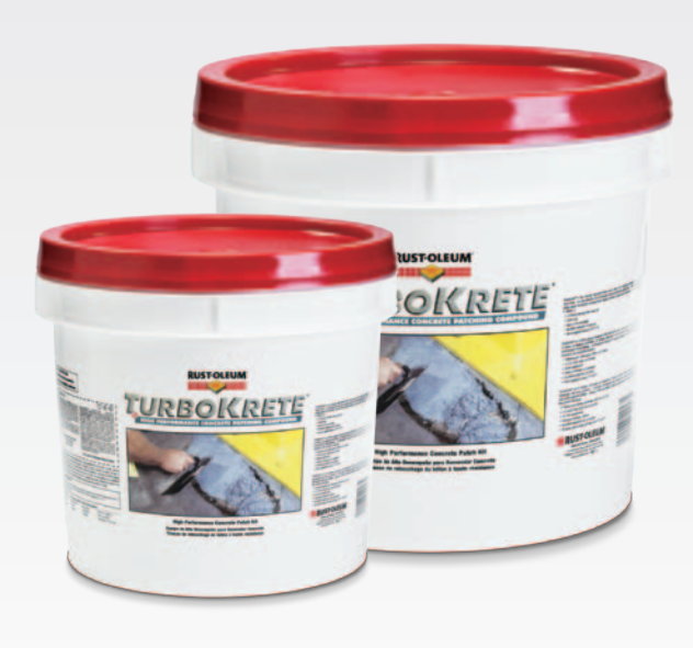
Kit contains: Part A, Epoxy Base, Part B, Epoxy Hardener Part C, Aggregate