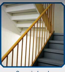
Occupied and confined spaces