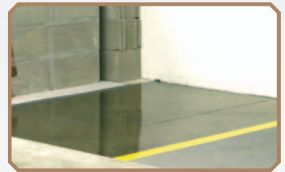
Long lasting protection