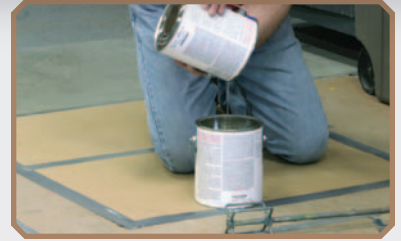
Minimal surface prep

Anti-Skid Additive #200504 For anti-slip