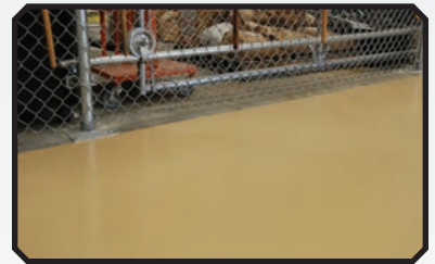
Long lasting protection