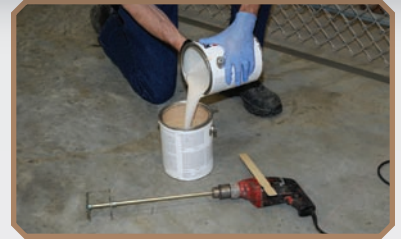
Minimal surface prep

Ultrawear Additive #213898 For anti-slip