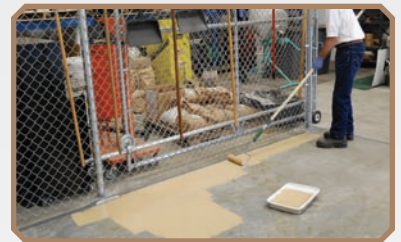
Easy roller application