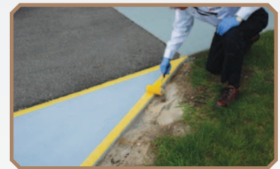
Just roll and go