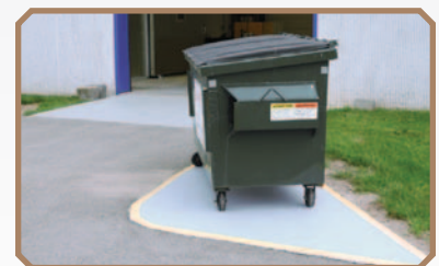
Protects against water damage, staining and mildew