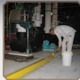
5S / organization and safety markings