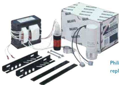
Philips Advance magnetic HID replacement kit