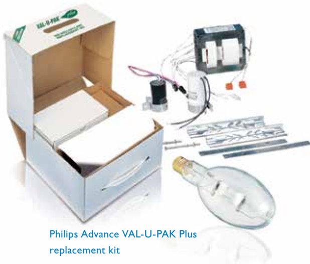
Philips Advance VAL-U-PAK Plus replacement kit