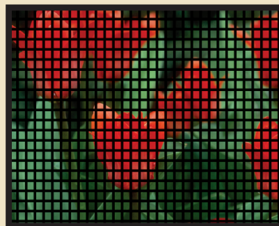
Standard 18x16 Fiberglass