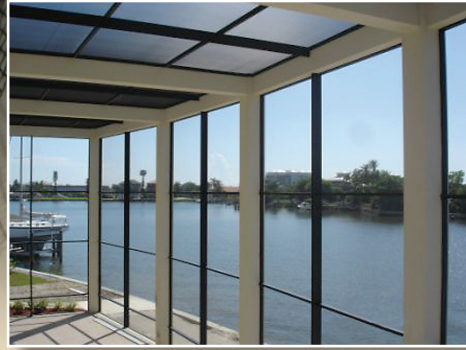
Excellent product for coastal regions