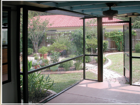
Perfect for patio door screens