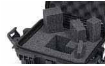
Multilayer cubed foam