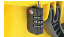
TSA approved padlock