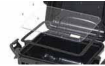
Waterproof panel kit