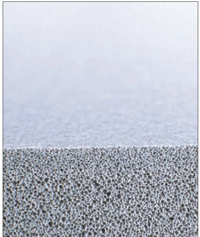
Without Dyna-Shield™ Surface