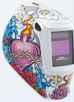
Illusion™ #256 165