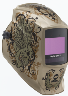
Sinister™ #256 157