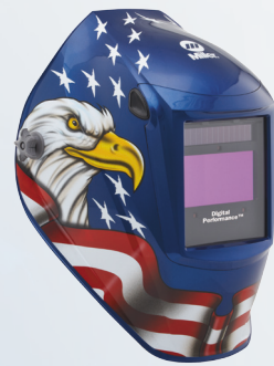
America's Eagle™ #256 161