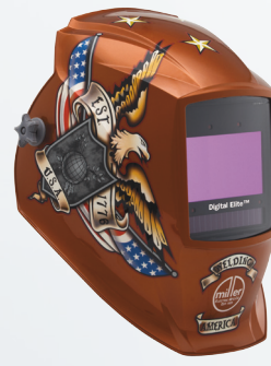
Vintage USA™ #257 215