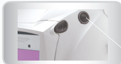
External Grind Button

Allows lens to track arc time while under the hood. (Titanium Series only)