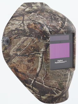
Camouflage #256 163