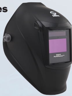
Black #256 159