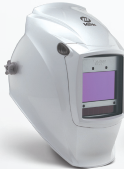
TITANIUM 9400™ #256 176