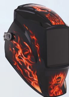
Inferno™ #235 627 (6 pack) #238 496 (each)