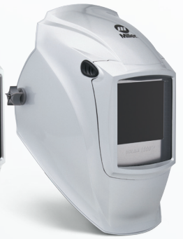
TITANIUM 1600™ #245 799