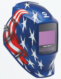
Stars and Stripes II™ #257 216