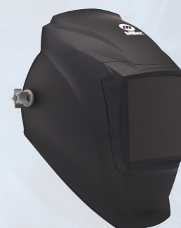
Black #235 626 (6 pack) #238 497 (each)