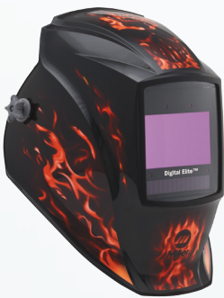
Inferno™ #257 217

Easy-to-use digital controls for adjusting settings.