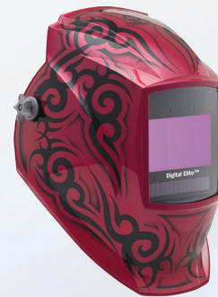
Fury™ #256 158