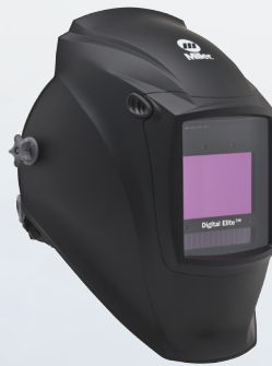
Black #257 213