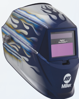
Blue Heat™ #256 170