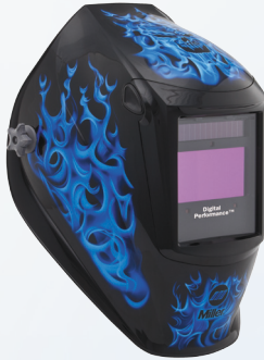
Blue Rage™ #256 164