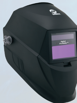
Black #256 166