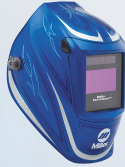
'64 Custom™ #256 160