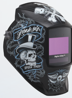
Lucky's Speed Shop™ #257 214