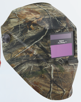
Camouflage #256 169