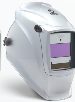
TITANIUM 7300™ #256 175