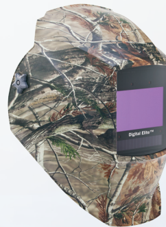
Camouflage #256 173