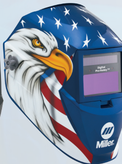
American Eagle™II #256 167