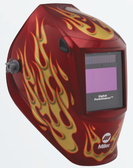
Fireball™ #256 162