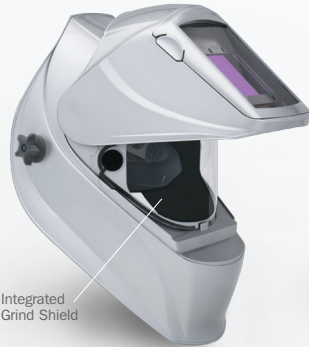
TITANIUM 9400i™ #256 177