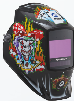
The Joker™ #257 218