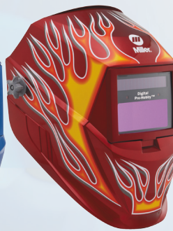
Red Flame #256 168