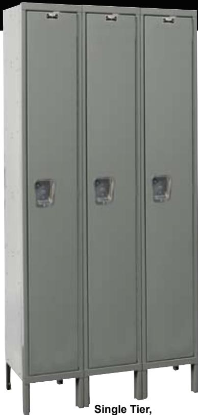
Single Tier, 3 wide, 3 openings