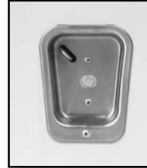
Deep-drawn stainless steel recessed handle with single-point latching