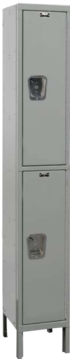
Double Tier, 1 wide, 2 openings