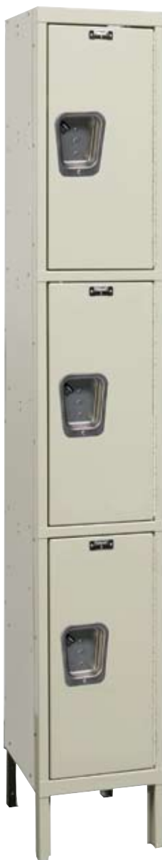
Triple Tier, 1 wide, 3 openings

Modern flush door design with safety-minded handle and reinforced door make our Maintenance-Free Quiet™ KD stock lockers the smart choice.