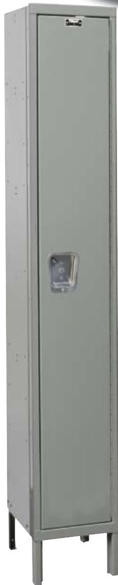
Single Tier, 1 wide, 1 opening