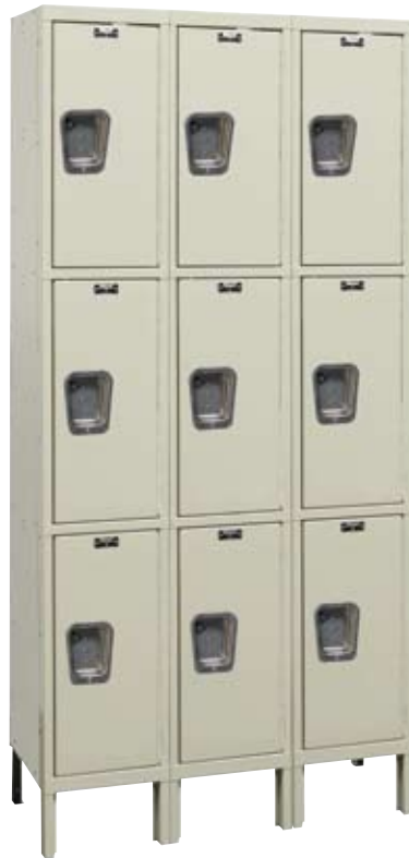
Triple Tier, 3 wide, 9 openings