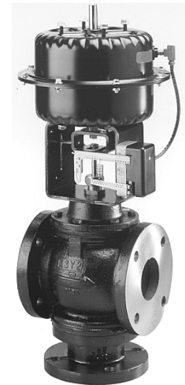
V-9502 Positioner Installed on a Rubber Diaphragm Type Valve Actuator

The starting point is the input pressure (Pilot P pressure) at which the actuator just begins to stroke. The starting point is field adjustable from 2 to 12 psig (14 to 83 kPa) using the starting point adjusting screw located under the V-9502 Positioner cover. Turning the screw clockwise decreases the starting point and turning the screw counterclockwise increases the starting point.