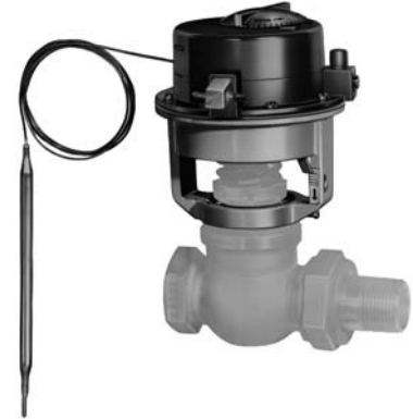
T-3111 Integral Thermostat and Piston Top Valve Actuator