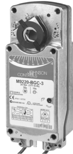
Figure 1: M9220-xxx-3 Electric Spring Return Actuator

A single M9220-xxx-3 Electric Spring Return Actuator provides a running and spring return torque of 177 lb-in (20 N·m). Two or three models mounted in tandem deliver twice or triple the torque (354 lb-in [40 N·m] or 531 lb-in [60 N·m]). Integral line voltage auxiliary switches are available on the xxC models to indicate end-stop position or to perform switching functions within the selected rotation range.