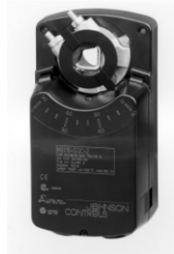
Figure 1: M9116 Series Actuator

A single M9116-GGx-2 or M9116-HGx-2 model delivers 140 lb·in (16 N·m) of torque. Two HGx models in tandem deliver twice the torque, 280 lb·in (32 N·m). The angle of rotation is mechanically adjustable from 0 to 90° in 5-degree increments. Integral auxiliary switches are available to indicate end-stop position or to perform switching functions at any angle within the selected rotation range. Jumpers on the actuator allow users to select the direction of action, range of control input, and calibration (fixed or adjustable). Position feedback is available through a 0 to 10 VDC signal.