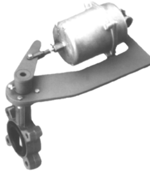
Two-Way VF Butterfly Valve with D-3153 Actuator

Refer to VF Series M9000 Electrically and D-3000 Pneumatically Actuated Standard-Pressure, Standard-Temperature Butterfly Valves Product Bulletin (LIT-977202) for important product information.