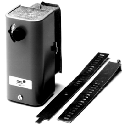
A19D Series Temperature Control