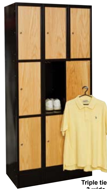
Triple tier, 3 wide

All lockers shown with optional closed metal base.