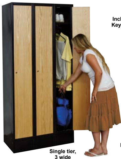
Single tier, 3 wide

APPEARANCE: Color: black frame with red oak doors.