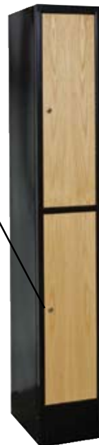
Double tier, 1 wide