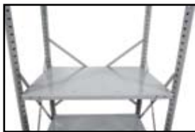
Box beam adjustable shelves

An innovative Hi-Tech design and specially designed components allow for a fast and easy assembly.