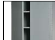
Swinging doors allow cabinet-style storage