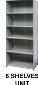
6 SHELVES UNIT