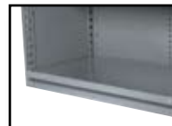
Base strip closes bottom. Used to prevent debris accumulation