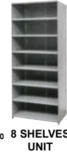
8 SHELVES UNIT