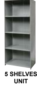
5 SHELVES UNIT