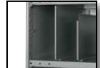
Shelf dividers for organized storage