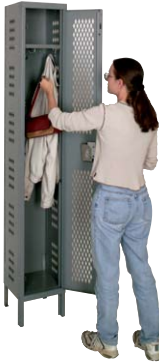
Single Tier, 1 wide, 1 opening