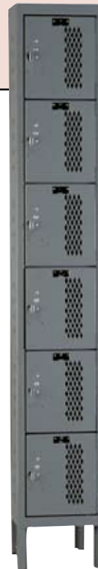
Six Tier, 1 wide, 6 openings