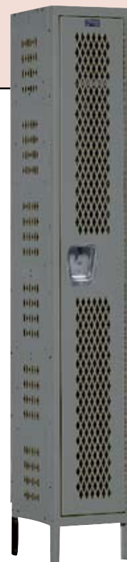
Single Tier, 1 wide, 1 opening