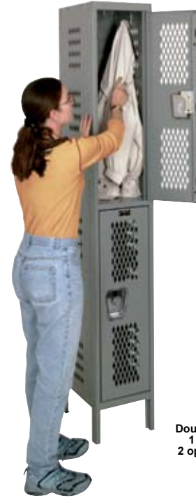
Double Tier, 1 wide, 2 openings