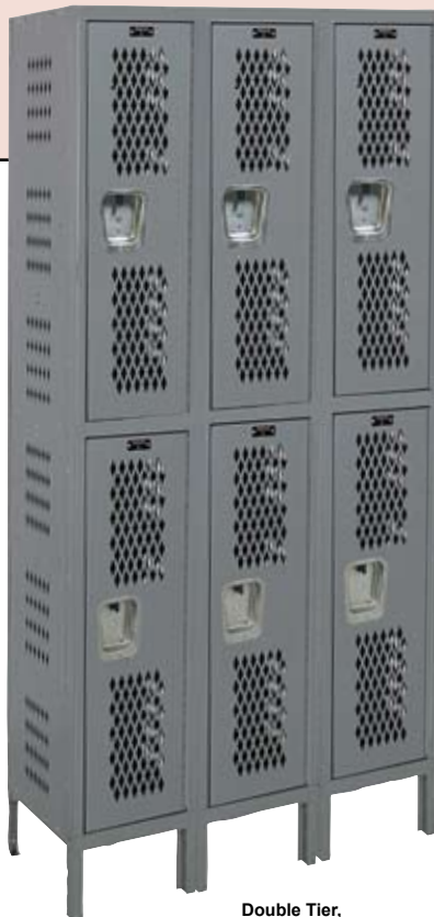
Double Tier, 3 wide, 6 opening