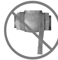
B.) Incorrect Installation: Heating tape hanging free from the surface

Ensure the heating tape is not kinked, twisted, or any portion of the tape hanging free from the surface (B). Do not overlap heating tape on itself (C). Attach the heating tape to the surface by using aluminum tape, fiberglass tape, or a mechanical clamping devices which will not cause damage to the heating tape.