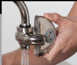
Rotating the front of the eyePOD one-half turn (in either direction) brings the eyewash spouts to the top and automatically resets the unit to operate as an eyewash.