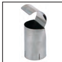
A-160-HG Shrink attachment for tubing up to 3/4"

Professional quality attachments & accessories provide the versatility to do more with your heat tool.