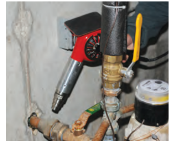
Heat pipes and more