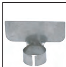
51542 Glass protector attachment