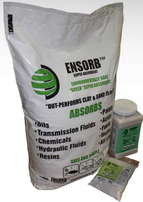
$ Approximate Cost To Absorb One Quart of Spilled Motor Oil

For more information, contact ENPAC Customer Service at 800.936.7229 or sales@enpac.com.