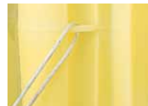
Tie-down feature for secure anchorage.