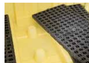
Grates remove for easy cleaning.