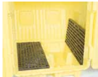
Massive sump has removable grates for easy cleaning.