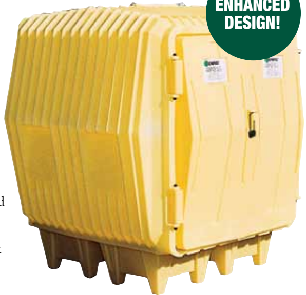
Door opening 41.5" W x 48.5" H

The newly-enhanced double doors provide added security and strength. Easy access for up to four (4) 55-gallon drums is provided while the double-wall and newly-enhanced hinges and lock latches keep contents secure. Hazard Hut® has a heavy-duty, four-way forkliftable design.