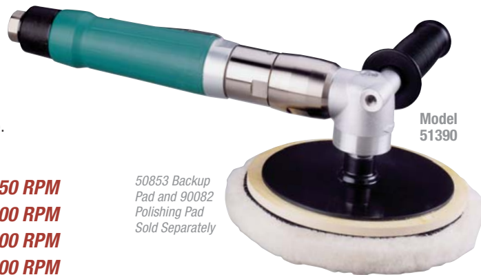
50853 Backup Pad and 90082 Polishing Pad Sold Separately