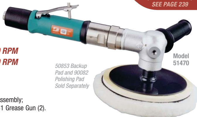
50853 Backup Pad and 90082 Polishing Pad Sold Separately

NOTE: For old-style tools 50816, 50823 and 50851, order 50797 (6" dia.) or 50798 (8" dia.) Accessory Kit.