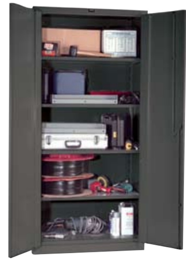
78" High Storage Cabinet