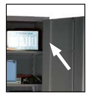
18-gauge full-height door stiffener provides maximum rigidity to both doors