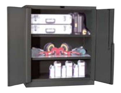
42" High Storage Cabinet