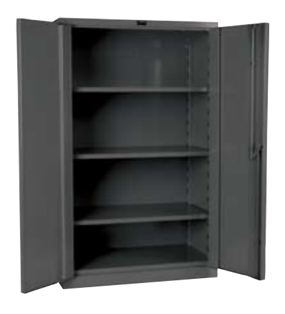
60" High Storage Cabinet