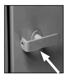
Heavy-Duty 3/16" thick steel handle with padlock hasp.