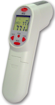
412 Gun-style Infrared with Thermocouple Jack