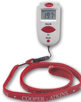
470 Mini Infrared