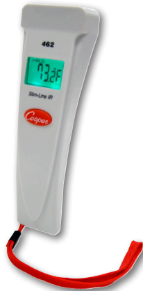
462 Slim-Line Infrared