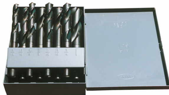
8-piece Black Oxide Set