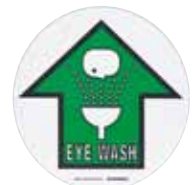
Eye Wash 12D578