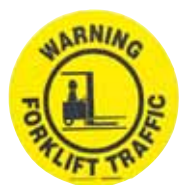
Warning Forklift Traffic 12D577