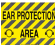
Ear Protection Area 12D568