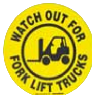
Watch Out For Fork Lift 12D575