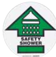
Safety Shower 12D584