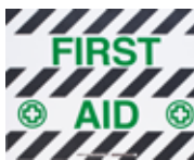
First Aid 12D571