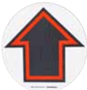
Arrow Symbol 12D587