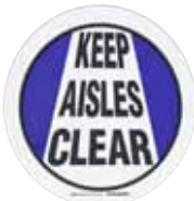
Keep Aisles Clear 12D582