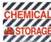
Chemical Storage 12D562