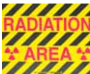
Radiation Area 12D561