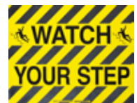
Watch Your Step 12D564