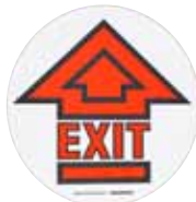
Exit Arrow 12D586