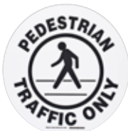
Pedestrian Traffic Only 12D574