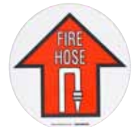
Fire Hose 12D585