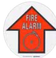
Fire Alarm 12D573