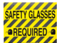
Safety Glasses Required 12D569