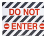
Do Not Enter 12D572