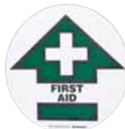
First Aid w/Arrow 12D583