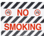
No Smoking 12D563