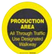
Production Area 12D576