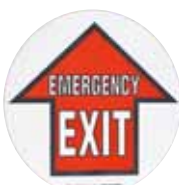
Emergency Exit 12D580