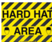
Hard Hat Area 12D568