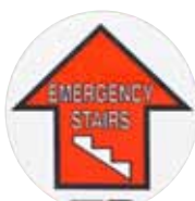
Emergency Stairs 12D579