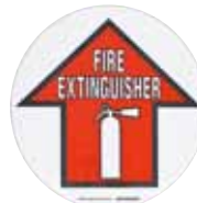
Fire Extinguisher 12D581