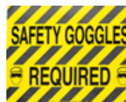
Safety Goggles Required 12D570