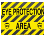
Eye Protection Area 12D567