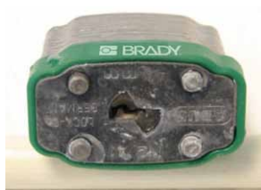
Brady Steel Padlock