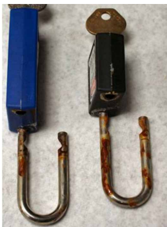
Competitor Safety Padlock

In accordance with ASTM F883-04, Brady padlocks and the competing padlocks were permanently exposed to vaporized salt water in a test chamber; they were taken out for a few minutes every 24 hours to take photos and check their function. Afterwards, locks were put back into the chamber and the test continued until 168 hours were completed. The results measured the appearance of the padlocks, the function of the lock and shackle changes.