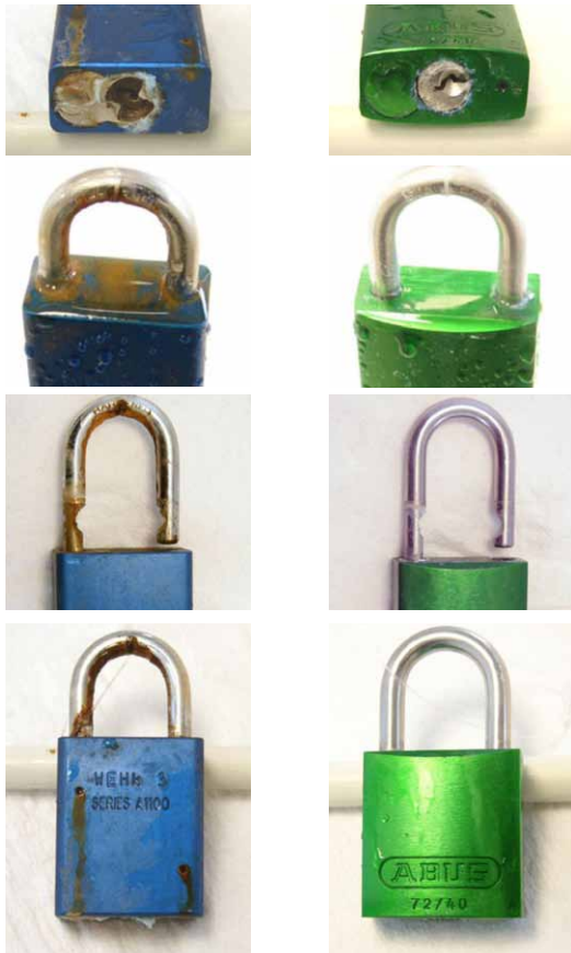
Competitors Aluminum Padlock

*This padlock was tested against two leading competitors' locks.