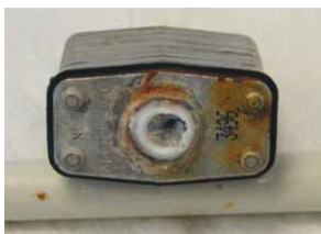
Competitor Steel Padlock

*This padlock was tested against a leading competitor's lock.