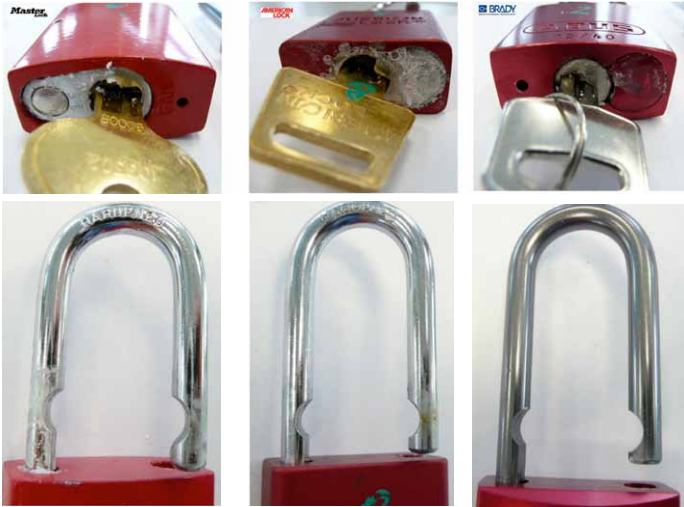
Competitor #1 Aluminum Padlock