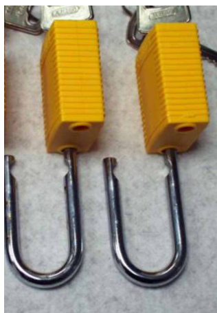
Brady Safety Padlock