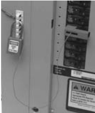
④ Pass plastic key through lock rail and attach lock, preventing key from sliding down cable and opening lockout device.