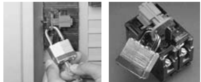
Universal Multi-Pole Lockout works with most two or three pole breakers utilizing a tie-bar.