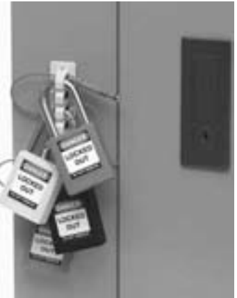
⑥ Low-profile lockouts allow panel doors to be closed on most breaker panels.