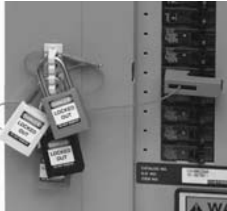
⑤ For group lockouts, run key through multiple loops in lock rail and apply locks. No hasps required!