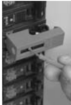
① Lockout device is unlocked by inserting and turning the red plastic key.