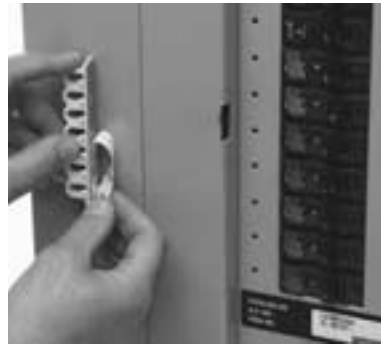
② Peel liner off bottom of lock rail, exposing super-bond adhesive. Permanently affix to any location on the panel. No drilling required!