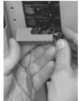
③ Attach the lockout device to the breaker and snap into locked position.