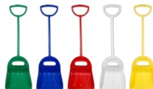
Green Blue Red White Yellow

Denotes product is made of FDA compliant materials.