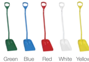
Green Blue Red White Yellow