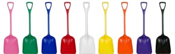
Pink Green Blue Red White Yellow Orange Purple Black