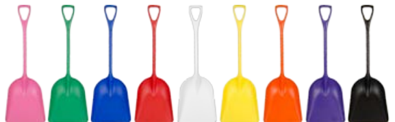
Pink Green Blue Red White Yellow Orange Purple Black