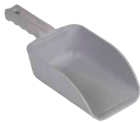
Metal Detectable 32 oz. Hand Scoop 6400MD