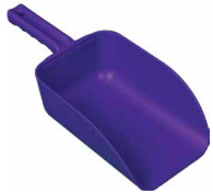
82 oz. Hand Scoop 6500