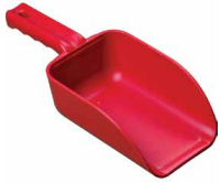
32 oz. Hand Scoop 6400