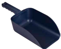
Metal Detectable 82 oz. Hand Scoop 6500MD