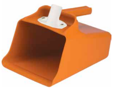
128 oz. Mega Dipper Scoop 6552