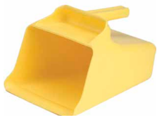
128 oz. Mega Scoop 6550