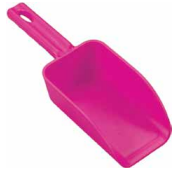
16 oz. Hand Scoop 6300