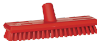
7041x / 7043x

Used in conjunction with a condensation squeegee or waterfed brush system, these handles allow for comfortable use reaching high walls, ceilings and overhead pipes. They feature a quick connect coupling for easy attachment of a hose or bottle.