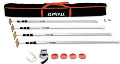
ZipWall® 12 4-Pack The perfect starter kit!