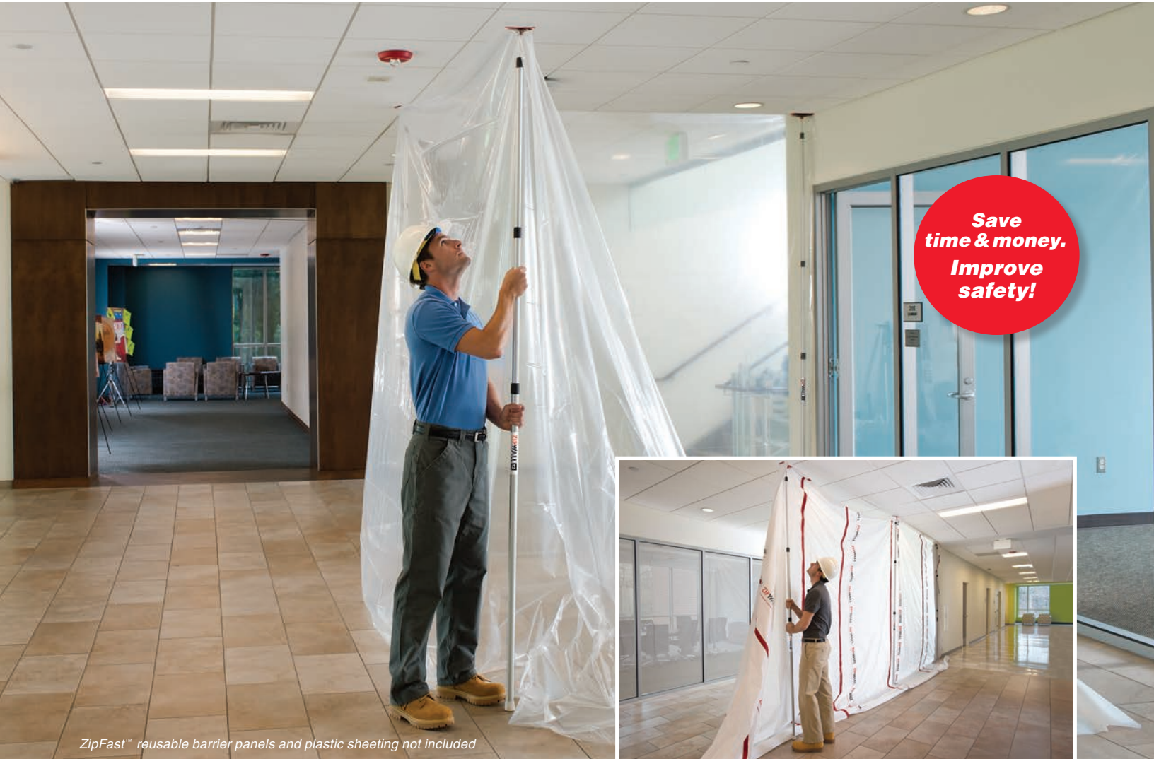
ZipFast™ reusable barrier panels and plastic sheeting not included