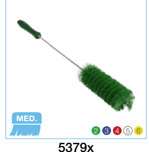
Vikan Ø2.0" Tube Brush