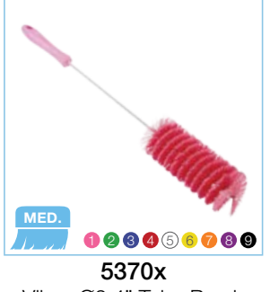
Vikan Ø2.4" Tube Brush