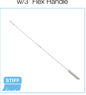
53865 Vikan Ø1.0" Tube Brush w/5' Flex Handle