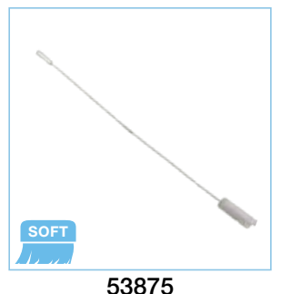
Vikan Ø2.0" Tube Brush w/5' Flex Handle