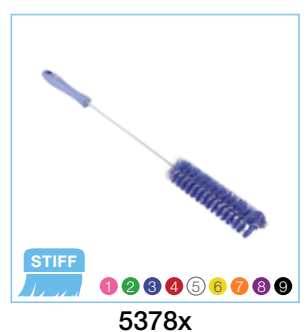
Vikan Ø1.5" Tube Brush