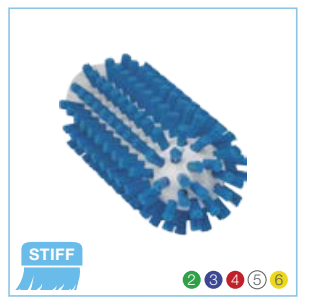
5380-50-x Vikan Ø2.0" Pipe Brush