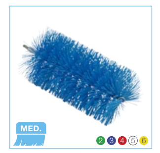
5391x Vikan Ø3.5" Pipe Brush for Flex Rod