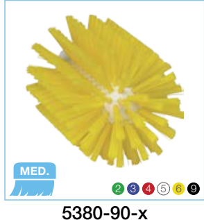
Vikan Ø3.5" Pipe Brush