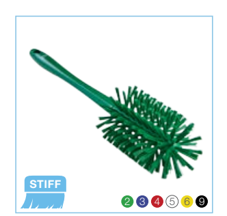
5381-90-x Vikan Ø3.5" One-Piece Pipe Brush