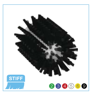
5380-77-x Vikan Ø3.0" Pipe Brush