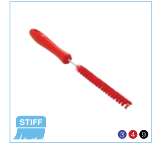
5360x Vikan Ø0.6" Drain Cleaning Brush