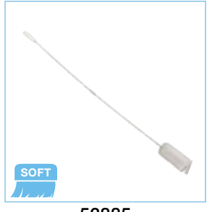
53885 Vikan Ø3.0" Tube Brush w/5' Flex Handle