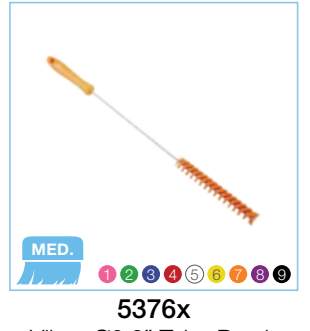
Vikan Ø0.9" Tube Brush