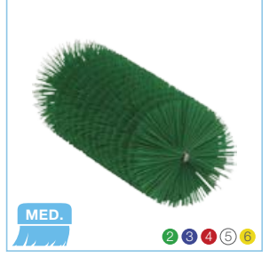
5356x Vikan Ø2.4" Tube Brush for Flex Rod

Nylon Handle — This handle is used to avoid damaging sensitive internal surfaces during cleaning.