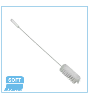
53835 Vikan Ø3.0" Tube Brush w/3' Flex Handle