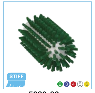
5380-63-x Vikan Ø2.5" Pipe Brush