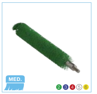
5365x Vikan Ø0.8" Tube Brush for Flex Rod