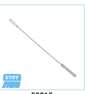
53815 Vikan Ø1.0" Tube Brush w/3' Flex Handle