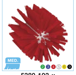
5380-103-x Vikan Ø4.0" Pipe Brush