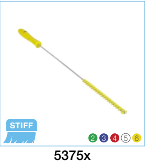
Vikan Ø0.4" Tube Brush