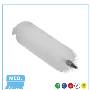
5368x Vikan Ø1.6" Tube Brush for Flex Rod