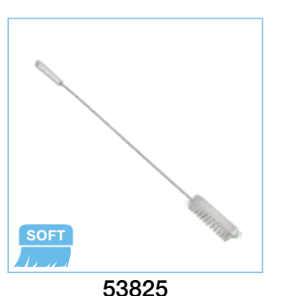
Vikan Ø2.0" Tube Brush w/3' Flex Handle